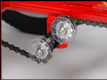
Chain Tensioner for Proseries 1416 and 1420 models