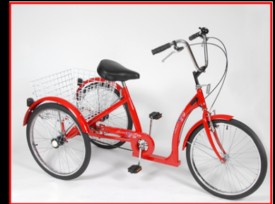
2700 Series 24" & 20" Models