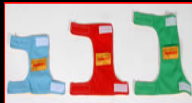
New Wrist Wraps